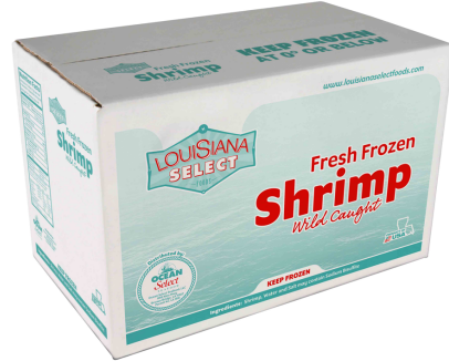
1# 51-60 SHRIMP BAG - FRONT